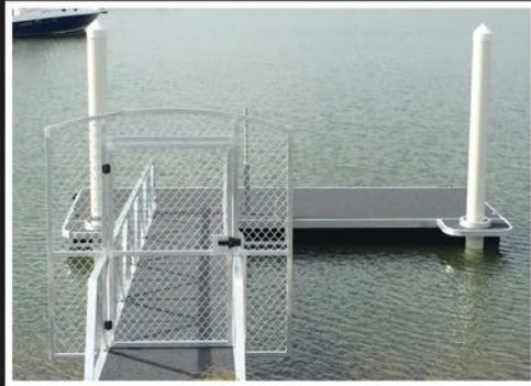
Concrete Flat Deck