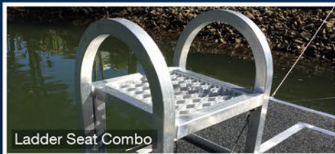
Ladder Seat Combo