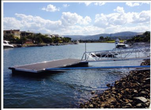
Concrete Strut Series