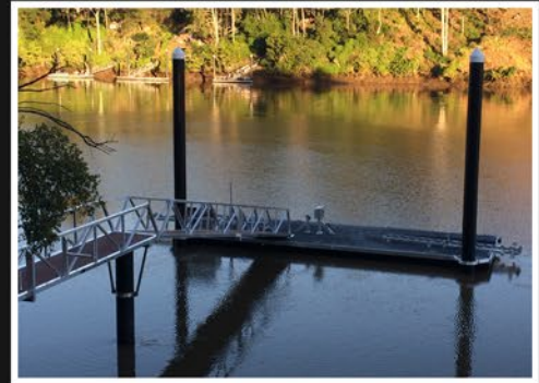
Concrete Dry Berth