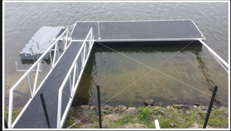
Aluminium Strut Light Weight Series