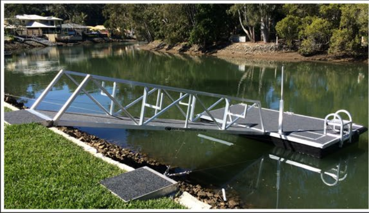
Aluminium Cable Light Weight Series